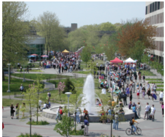
Stony Brook University